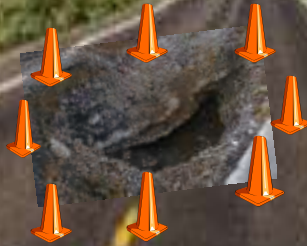
Route 422 Sinkhole